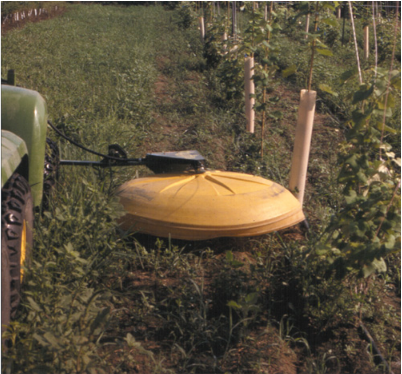
Shield on this sprayer prevents herbicide from contacting young grapevines.