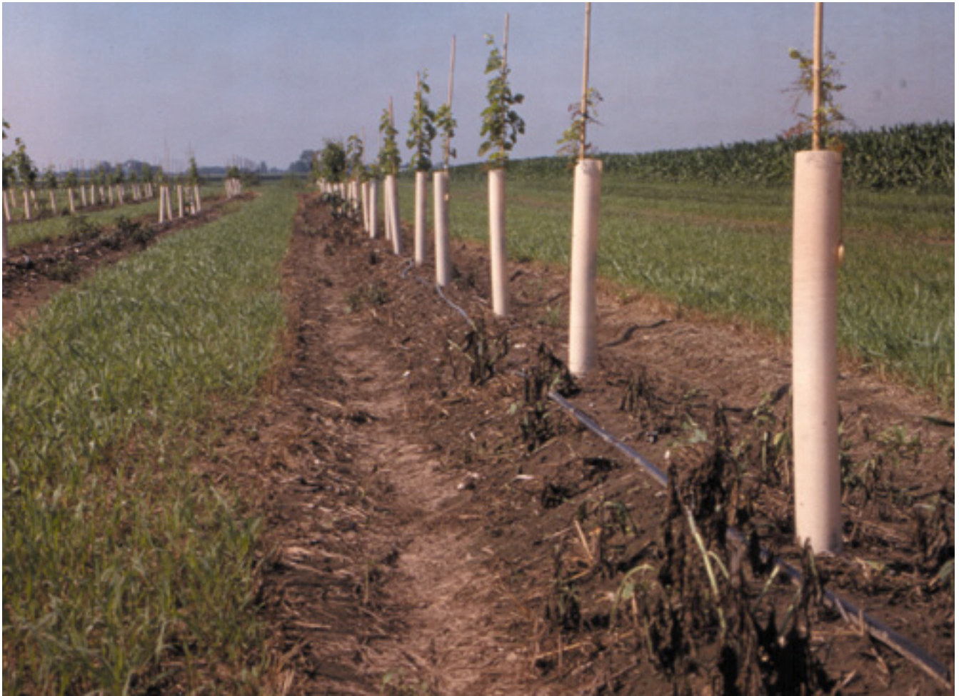
A 3- to 4-foot area under the trellis is kept weed-free. Permanent sod is grown between rows.