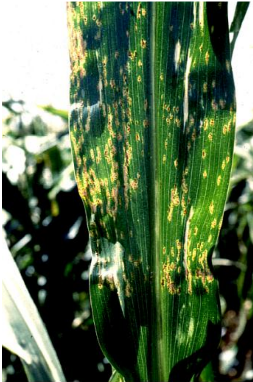
Common rust ( Puccinia sorghi ) on corn.

Damage related to common rust varies widely from year to year. The earlier the infection the more severe the disease is likely to become. Under heavy infestations, such as in 1993, yields can be reduced as much as 50% (28). Common rust affects field corn, seed corn and sweet corn in Michigan.