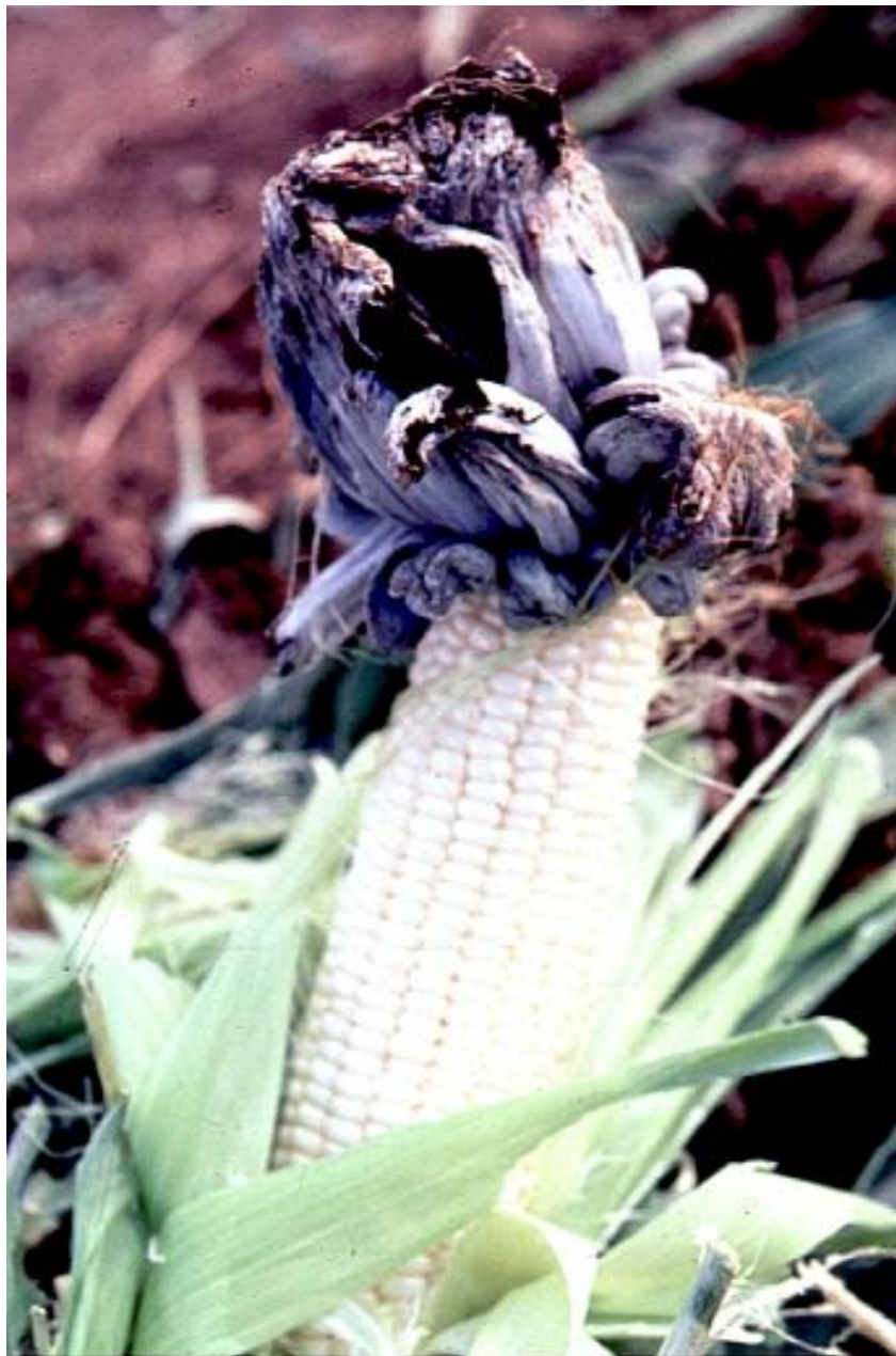
Common smut ( Ustilago maydis ) on corn.

Common smut is found worldwide wherever corn is grown, although it is most prevalent in warm and moderately dry areas. Common smut affects field corn, seed corn and sweet corn.