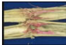
Gibberella Stalk Rot

Gibberella : Leaves on early infected plants suddenly turn a dull grayish green while the lower internodes soften and turn tan to dark brown. The stalks often show an internal pink to reddish discoloration of the diseased tissue. The fungus causes shredding of the pith and may produce small, round, black perithecia superficially on the stalks. Lesions may develop concentric rings. This disease can be differentiated from Diplodia stalk rot by pith discoloration and the superficial perithecia.