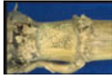
Diplodia Stalk Rot

Methods of Transmission: The fungus overwinters as perithecia, mycelium or chlamidiospores in infected plant debris. Perithecia on infected corn stalks mature and give rise to ascospores that are released in the spring under warm wet conditions. The ascospores are vectored by wind to cornstalks where they will germinate and penetrate the host tissue resulting in a new infection (34). The pathogen survives in soil and on crop residues. Spores are wind-borne (23).