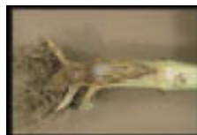
Fusarium Stalk Rot

Fusarium spp.: This rot is difficult to distinguish from Gibberella stalk rot. Rotting commonly affects the roots, plant base, and lower internodes. It normally begins soon after pollination and becomes more severe as the plant matures. A whitish-pink to salmon discoloration of the pith, stalk breakage, and premature ripening are the same as for Gibberella stalk rot.