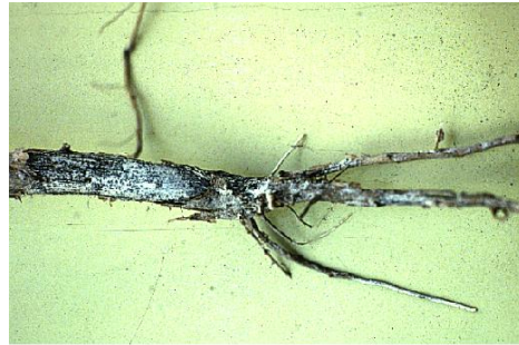
Charcoal rot ( Macrophomina phaseolina ) on soybean.

Symptoms: Infected seedlings can show reddish-brown discoloration at the emerging portion of the hypocotyl. If infection occurs through the roots, discoloration is evident at the soil line and above. The discolored area turns dark-brown to black and infected seedlings may die under hot, dry conditions. Later, a light-brown discoloration of the subepidermal tissues in the taproot and lower part of the stem develops. At first infected plants do not show aboveground symptoms, however, in a more advanced stage, leaves turn yellow, wilt and remain attached. Superficial stem lesions may extend from the soil line upwards. When the epidermis is removed, small black bodies may be so numerous as to give a grayish-black color to the tissues. The sclerotia resemble a sprinkling of finely powdered charcoal. When split open, the taproot and base have black streaks in the woody portion and frequently sclerotia are formed in the pithy area of the stem (30).