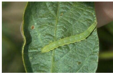
Green cloverworm larva

The green cloverworm can be found at subeconomic levels in most soybean fields. Occasionally, however, conditions produce a population explosion of this pest, which results in heavy defoliation of soybean plants (13). Green cloverworms feed on the foliage, giving plants a ragged look. They may also attack the pods when infestations are heavy (2).