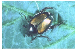
Japanese beetle adult on soybean leaf.

Japanese beetles are common, but seldom an economic problem in soybean production in Michigan. Although, Japanese beetle larvae are increasingly becoming a problem in Michigan crops. Large numbers of Japanese beetles frequently gather in soybean fields during late July and August (13). The adults feed on leaf tissue between veins giving a 'skeletonized' appearance (3).