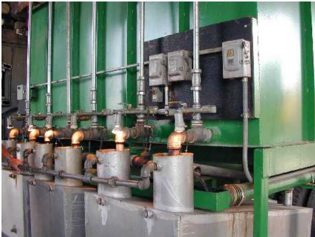
Mint tubs attached to Vapor Pipe

After the oil has been extracted, some mint growers compost the hay and spread it on the field at a later time or place the mint hay directly onto other fields. A mint farmer in Michigan, Tom Irrer, however spreads the hay back onto the field immediately following mint oil extraction. Many mint growers do not replace mint hay back onto the mint field at all, rather they put it onto another field. The photo below is from Tom Irrer's farm where the mint tub is brought directly out into the field and the hay dumped into the mechanical spreader. The hay is still steaming, but does not seem to have any affect on the following years crop (20).