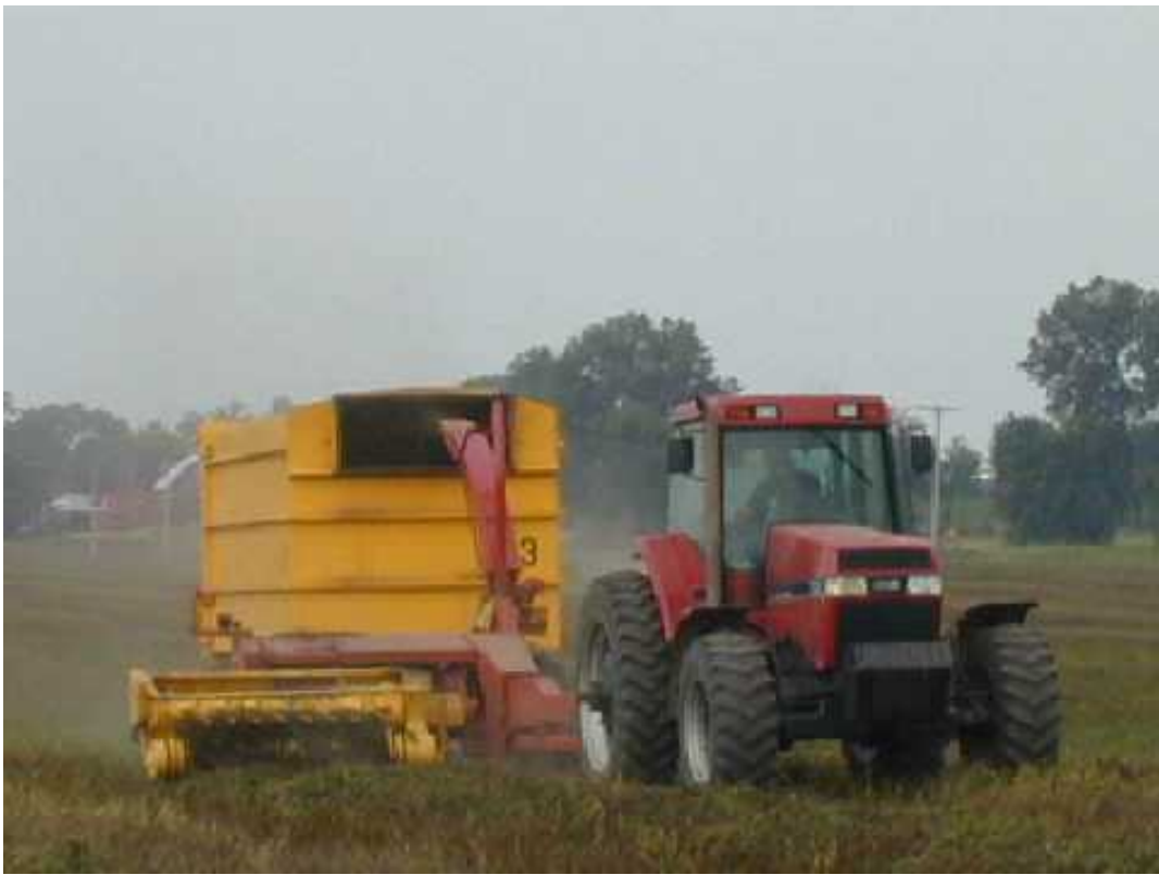
Mechanical Forage Chopper Distillery Receiving Can