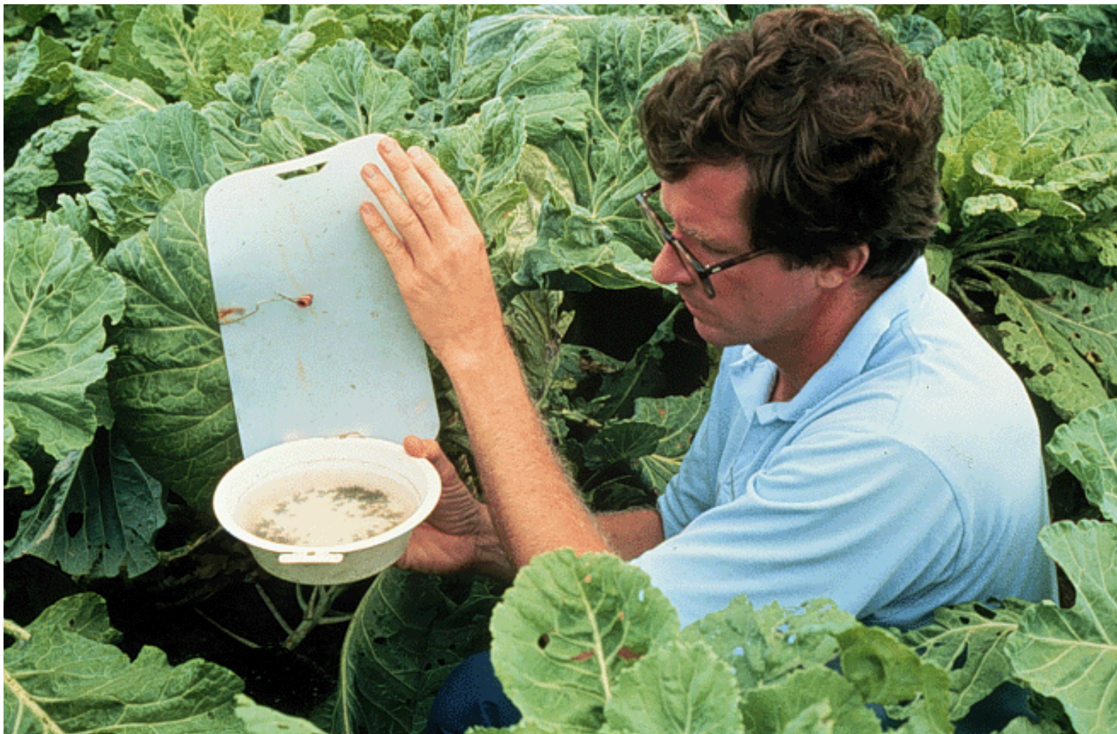
Figure 2. County Extension agent checking diamondback moth sex pheromone trap.