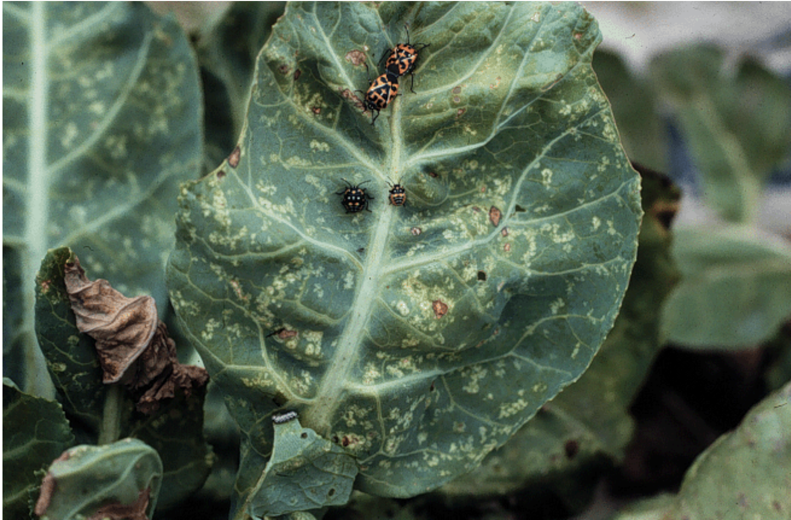
Figure 3. Harlequin bugs on collards.

Both the nymphs and adults pierce stalks and leaves with needle-like mouthparts to feed on plant juices. Injury to the stalks and leaves of younger plants can cause wilting, brown coloration and eventual death of the plant. Older plants can be stunted. Overwintering populations of adult Harlequin bugs can be reduced by plowing under field debris at the onset of winter and the destruction of weeds in fields and along field borders to eliminate overwintering sites. Cultural practices such as planting resistant varieties also help to manage these insect pests. Insecticides are used to manage harlequin bugs when they are small and first appear. Repeated application of insecticides are often required.